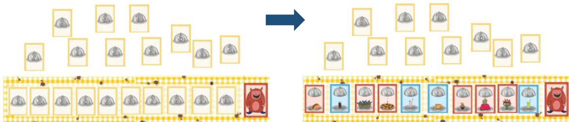
Forward counting game with number cards 1-10

Children take turns placing the next number in the number sequence (e.g., if you begin with 1, the next number would be 2), placing the food side down, and not looking at what is on the other side of the card. An adult may encourage children to find the next card by saying, "What number comes after/before X?". Once children have placed all the cards to reach the monster, an adult may check that the numbers are in the correct order and ask children to correct any errors before they can turn over the cards to see what they have fed the monster. Children may now select a new monster and a new number interval and play again!