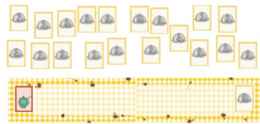
Backward counting game with number cards 1-10