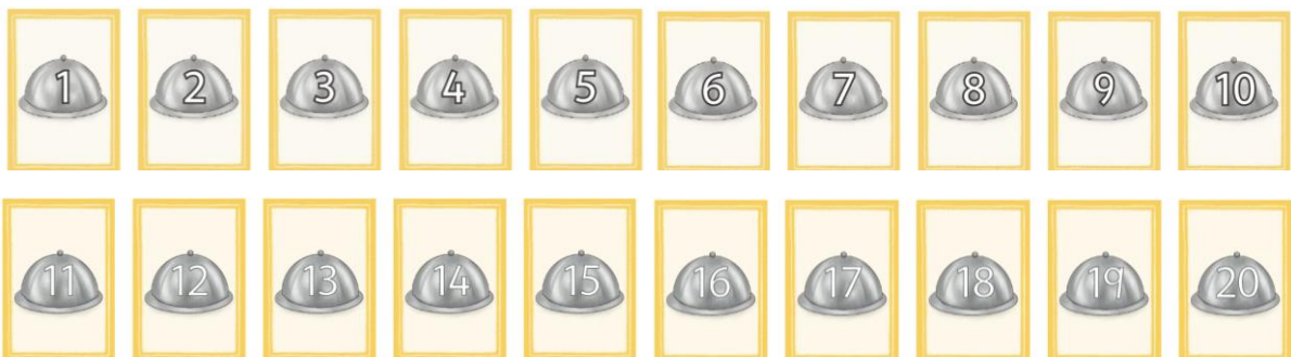
Number cards from 1 to 20