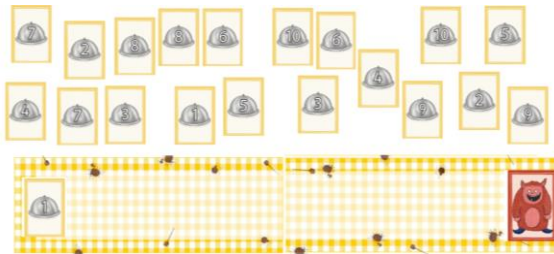
Forward counting game with number cards 1-10